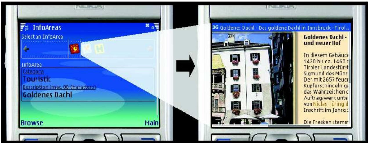
Figure 1: a click on the selected icon opens the respective web page